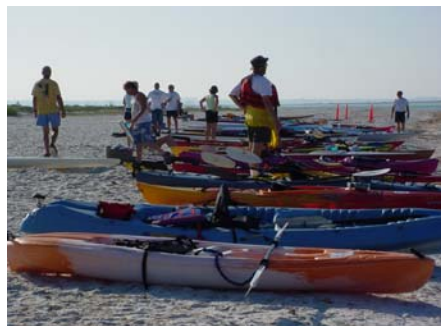
Kayaks, all in a row, waiting for the Caladesi Kayak Challenge race to begin. Thirty-five racers participated.