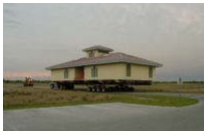
Rounding the turn in the park.

Stay tuned for the date of the Grand Opening. We'll have a celebration of the hard work and success of so many people who have helped make this dream come true.