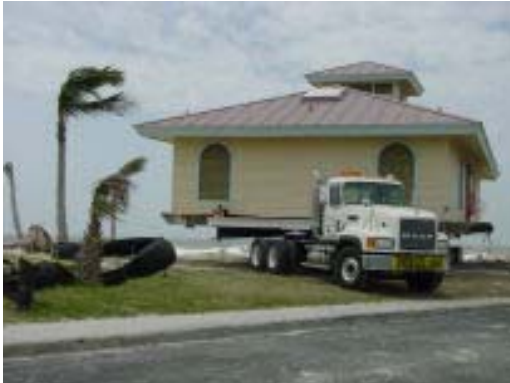
The building as it moves off the beach.

On April 7, Bath House 4 moved from its place on the beach to its new location on St. Joseph Sound. Thanks to all who came to watch the migration (like shore birds) and brave the weather.