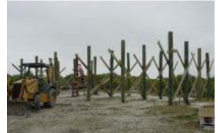
The pilings at the new site where the building will sit.

classroom/media room. Exhibits will be ready for installation when the interior renovations are complete.