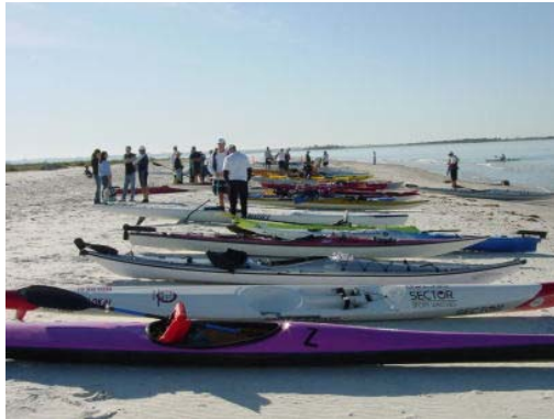
Getting ready to race.