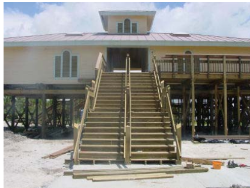
Grand stairway to the Rotary Centennial Nature Center at Honeymoon Island.

Stay tuned for the date of the Grand Opening. We'll celebrate the hard work and success of many people who helped to make all this happen.