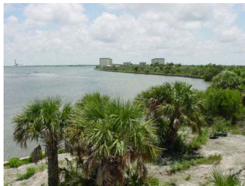
View of St. Joseph Sound from the deck of the Nature Center.