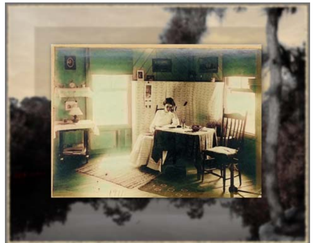
An Historic Image from Koreshan S.P.

These volunteers were recognized for their contributions at te volunteer appreciation day on Saturday February 21st at Koreshan State Park . Thank you for everything you do to help us at both Caladesi and Honeymoon Island!