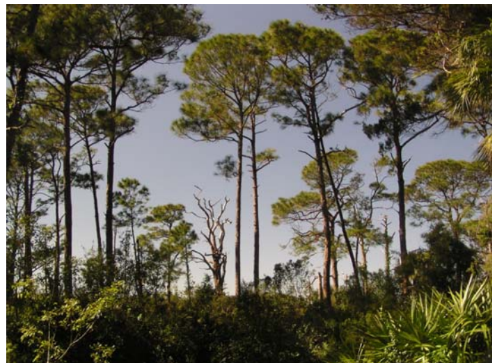
The Pine Flatwoods along the Osprey Trail