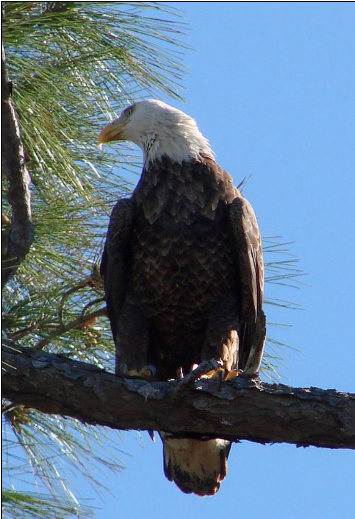
American Bald Eagle by Ray Dabkowski

The walk out to the Eagle nest was just delightful with Woodpeckers calling, Yellow-rumped and Palm warblers pippin away in the brush and young Armadillos working the ground under the palmettos. A big ole Gopher tortoise was munching away on a prickly pear cactus. Ospreys were calling and mating in their nests. Some were eating big fish in the dead snags.