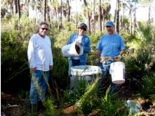
Manager's day off

People often suggest that things must get pretty slow at a beach park in wintertime. But they overlook the fact that there is a lot more to Caladesi Island State Park than our beautiful beach.