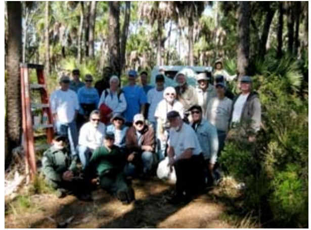
Zone 6 team

Even in this cooler weather, the beach is by no means off limits. The shelling seems to be the best in the wintertime. And a stroll along the beach in cooler weather is always refreshing. Don't be surprised if you even see some hardy souls swimming. What seems like intolerably cold water to Floridians isn't half bad to folks visiting from North or overseas.